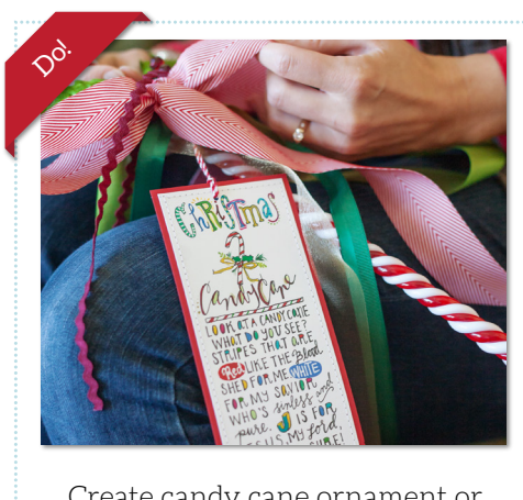
Create candy cane ornament or home decoration.

Talk as a family about the many ways Jesus is our Good Shepherd.